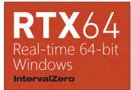
Windows 10 IoT is real-time enabled by RTX64.

Windows 10 IoT is a OneCore OS, App and Device platform including runtimes and frameworks.